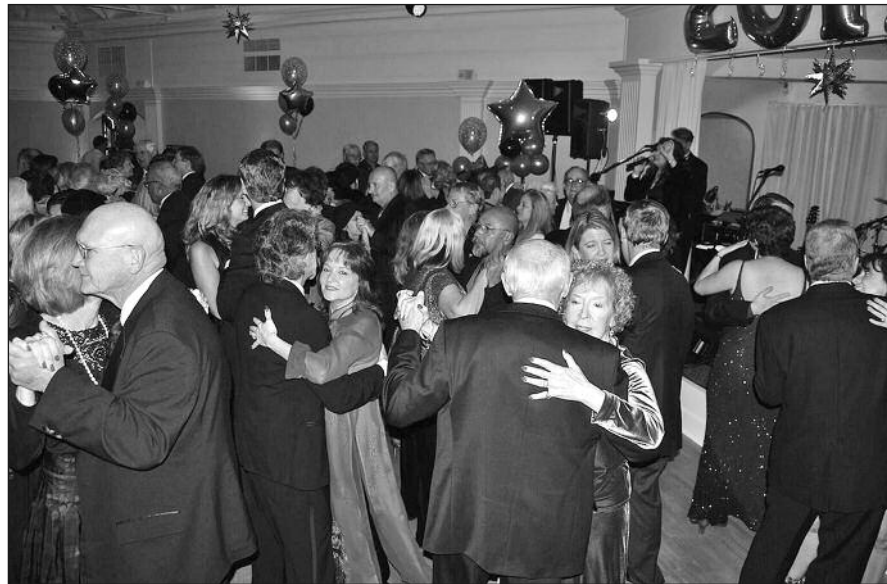
The evening kicks off with a ballad by "Hot Pursuit". (See more photos on p.55.)

Maui Mermaids Beachwear, Village Book Exchange and OC Tykes participating. Christy Quiggle Designs offered a hand-crafted custom necklace, while The Fisherman's Restaurant tempted with two $50 dinner certificates. Lowe's contributed a Ceramic Fire Bowl for the patio, with Red Shoes Culinary Services promising to serve up four hours of magical cuisine for a personal party in your home. Meanwhile, in adjacent History Hall, the Home Design Consignment Center was conducting a Silent Auction. Important decisions were